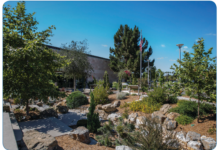
The RightScape Demonstration Garden in front of IRWD's Sand Canyon building displays attractive and easy-to-identify drought-tolerant plants.

IRWD meets roughly 28 percent of the service area's water demands with recycled water. Every gallon of recycled water used results in a gallon of drinking water that can be saved for potable users. Using recycled water extends drinking water supplies and reduces reliance on costly imported water, helping to improve water supply reliability.