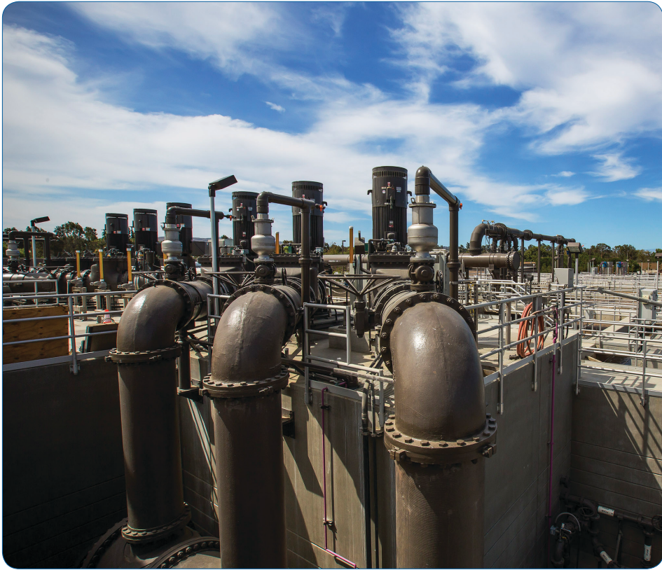
Pumps and pipes for the membrane bioreactor at the expanded Michelson Water Recycling Plant.