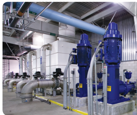
Degasifiers (at left) & Final Product Pumps