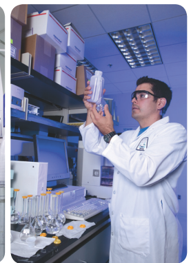
Testing DATS water