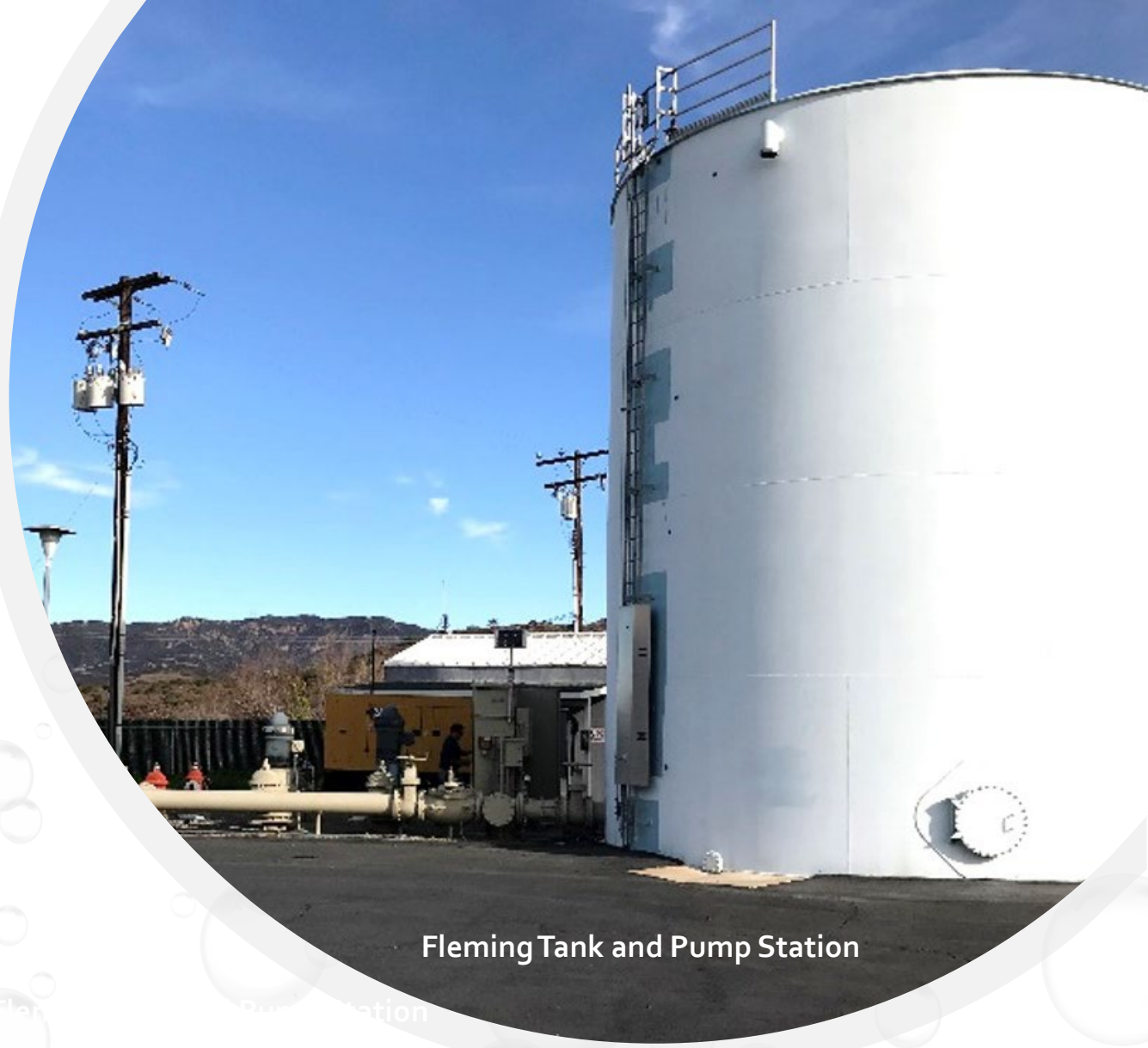
Fleming Tank and Pump Station