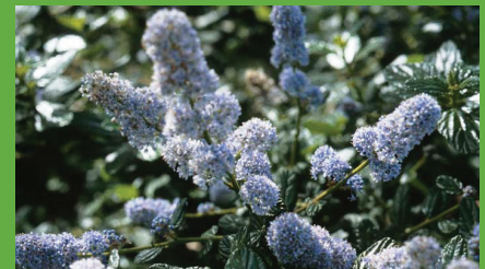
Carmel Creeper Ceanothus